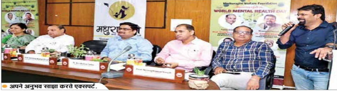
● अपने अनुभव साझा करते एक्सपर्ट.